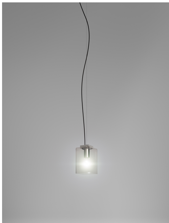
TUBES SP 20 FUTR NO E27 CE